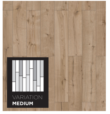
INSPIRATIONS - WOODSIDE IH56145