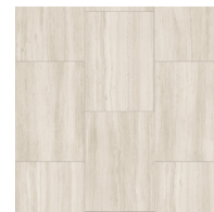
Limestone Vein Cut TPWP0424