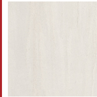
Pello Rock Natural TPWP0417