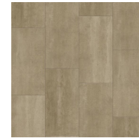
Linear Stone Beige TPWP0416