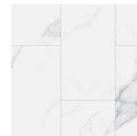
Carrara Marble TPWP0423