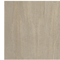
Pello Rock Sandstone TPWP0418