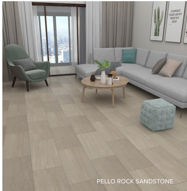
PELLO ROCK SANDSTONE

A portion of all sales of Sparta goes to support Ronald McDonald House Charities.