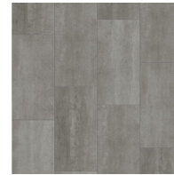
Linear Stone Grey TPWP0415