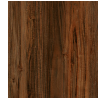
Natural Acacia TPWP0411