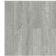
Ocean View TPWP0410