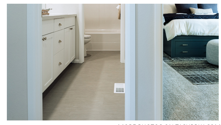
MORE PHOTOS ON TASUPPLY.COM

Daybreak's Manor Collection homes are open to view now and won't be on the market long. The Bainbridge is approximately 3,183 sq ft with 4 bedrooms and 3.5 baths. The Magnolia is 2,501 sq ft with 4 bedrooms and 2.5 baths. Residents will enjoy an optimal location between the shopping and movie entertainment at Sunrise Village in Puyallup and the historic downtown area of Orting.