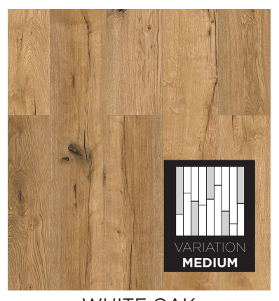
WHITE OAK IH56359