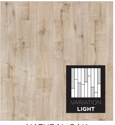
NATURAL OAK IH56356