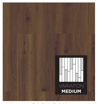
CASK OAK IH56352