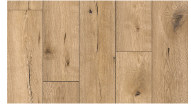
TRIMBLE WHITE IH53458T