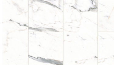
REPOSADO CARRARA* IH53464T