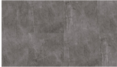
SESAME SANDSTONE* IH53465T