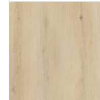
Scandinavian Oak TPWP0413