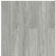
Ocean View TPWP0410