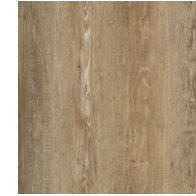
Northern Pine TPWP0404