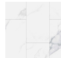
Carrara Marble TPWPD0423