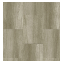
Italian Stone Crema TPWPD0420