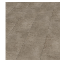
Concrete Stain Marrone TPWPD0422