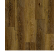
Canyon Hills TPWP0405