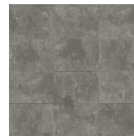
Concrete Stain Naturelle TPWPD0421