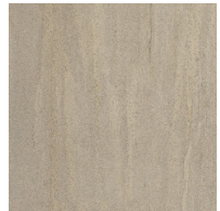
Pello Rock Sandstone TPWPD0418