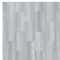
Italian Stone Grigio TPWPD0419