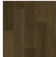
American Walnut TPWP0412