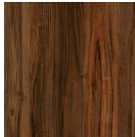
Natural Acacia TPWP0411