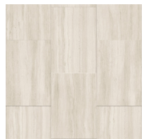
Limestone Vein Cut TPWPD0424