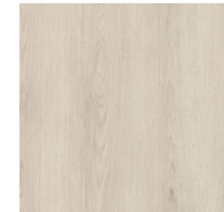
Nordic Oak TPWP0414